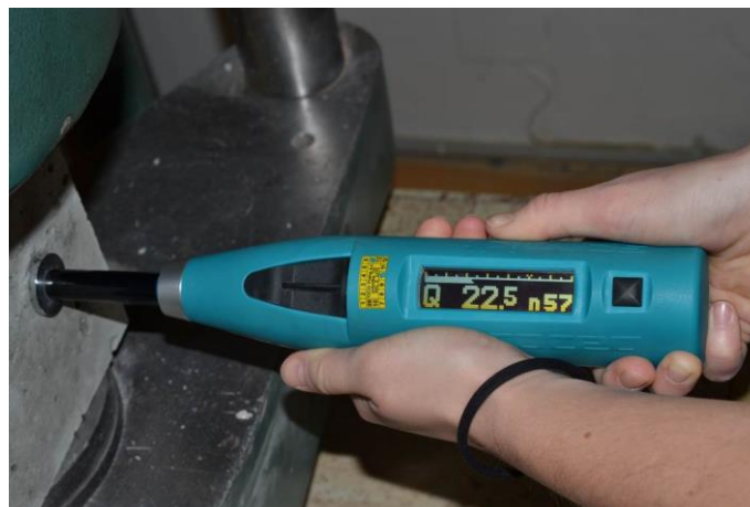
Figure 1. Test hammer SilverSchmidt PC L with the mushroom plunger [1].

The SilverSchmidt test hammer uses optical sensors to measures the speed of the impact as well as of the rebound immediately before and after the impact while calculating the amount of energy that can be recovered. The Q value allows to extend the range of standard conversion relationships for concrete strength at both ends of the scale. The strength range of the SilverSchmidt test hammer is from 10 N/mm 2 to 100 N/mm 2 , which allows testing of modern high strength concrete. When using the mushroom plunger for SilverSchmidt PC L (see figure 1), even a low compressive strength from 5 N/mm 2 can be determined. The described experiment deals particularly with concrete tests with this mushroom plunger.