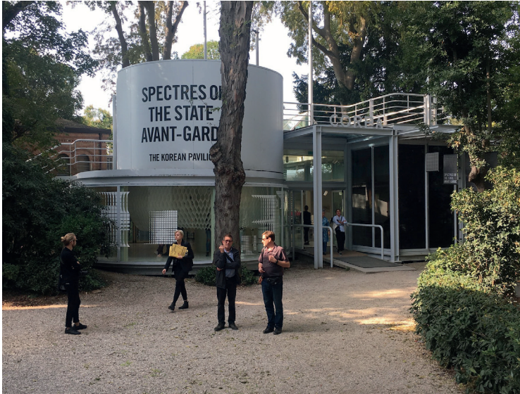
Fig.2. The Korean Pavilion in 2018 (Author)

At the Venice Architecture Biennale in 2018, the Korean Pavilion presented an exhibition that consists of two archives: 'Absent Archive'; and 'Emergent Archive'. Here, the critical perspective toward the past and the present in the format of architecture on display merged in archival records and turned into architectural work as they were. It signifies the pavilion's current role and importance, transformed within the Korean architecture scene and the Biennale's perennial nature. Indeed, the trajectory of the Korean Pavilion resulting from its political birth bears its premature start and the evolution of domestic discussion on architecture and architecture exhibition in South Korea at the same time. In this context, the beginning of the Korean Pavilion, initiated from peripheral ambitions, brought Korean architecture an accidental yet significant opportunity for having its first standing architectural platform as the aftermath.