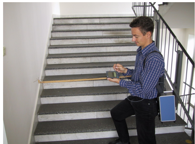
Fig. 1 Portable receiver controlled by PDA computer

Seven multi-floored buildings, mostly in Prague, were chosen to cover the selected environment classes. The measured data were treated separately according to the classification.