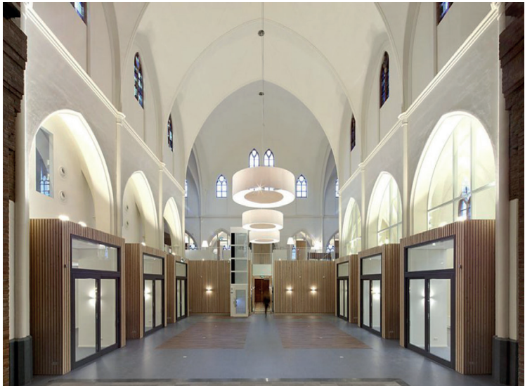
Img. 5. Conversion of the Church of St. Gertrudis in Heerle into a cultural centre. A view of the lobby.