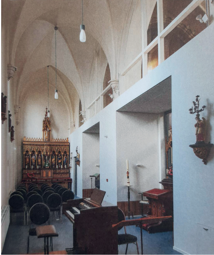
Img. 6. Conversion of the Church of St. Gertrudis in Heerle into a cultural centre. A view of the side aisle.