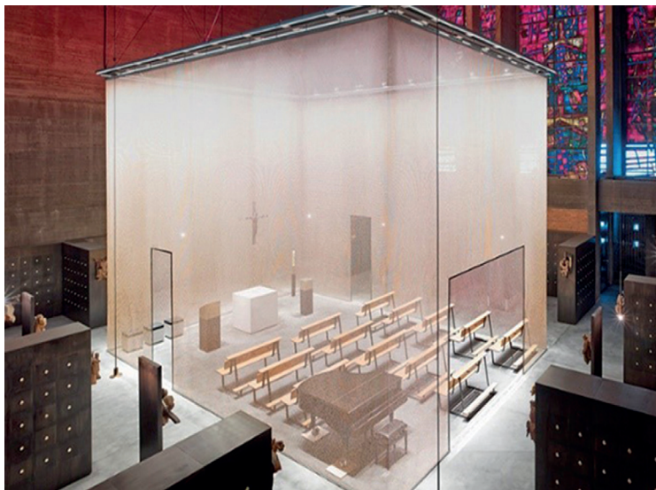
Img. 2. Conversion of the Church of St. Bartholomew's in Cologne into a Columbarium.

St. Lawrence Church in Rotterdam is used both for sacred and cultural functions (Img. 3). There are Holy Masses of the Protestant and Catholic communities on Sundays. In addition, organ concerts, permanent exhibitions, and other cultural events are held there. In the permanent exhibition, the side chapels present events from the history of the city and the church.