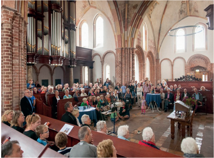
Img. 4. Garmerwolde Church, 2018.