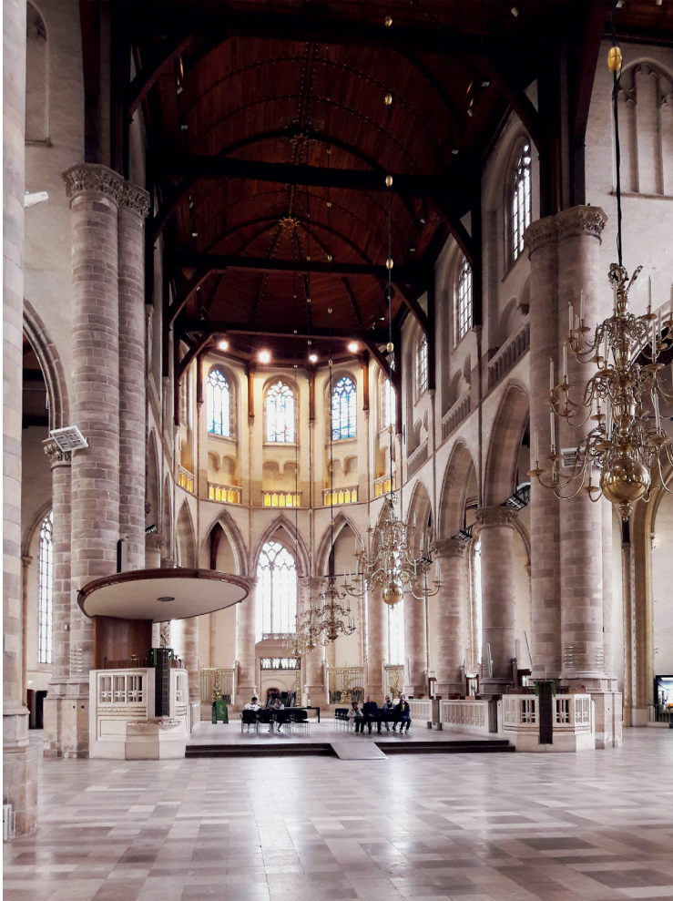
Img. 3. Conversion of the Church of St. Lawrence in Rotterdam into a cultural centre (Source: M.Arno).