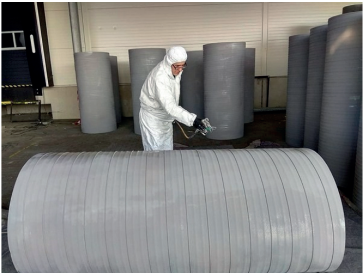
Fig.5. Application of thermal insulation from hollow glass-ceramic microspheres on ductwork