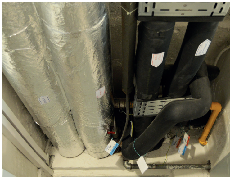
Fig. 1. Common thermal insulation on technical installations

significant heat loss through the pipes to their surroundings, which could further negatively affect the functionality and reliability of the entire system, as well as the fact that possible condensation of water vapor on the outer surface of the pipe, caused by malfunctioning insulation, can cause degradation of surrounding structures and their hygienic defects. We should also not forget the suitability of reducing the surface temperatures of all elements of technical equipment of buildings with regard to the safety of their use.