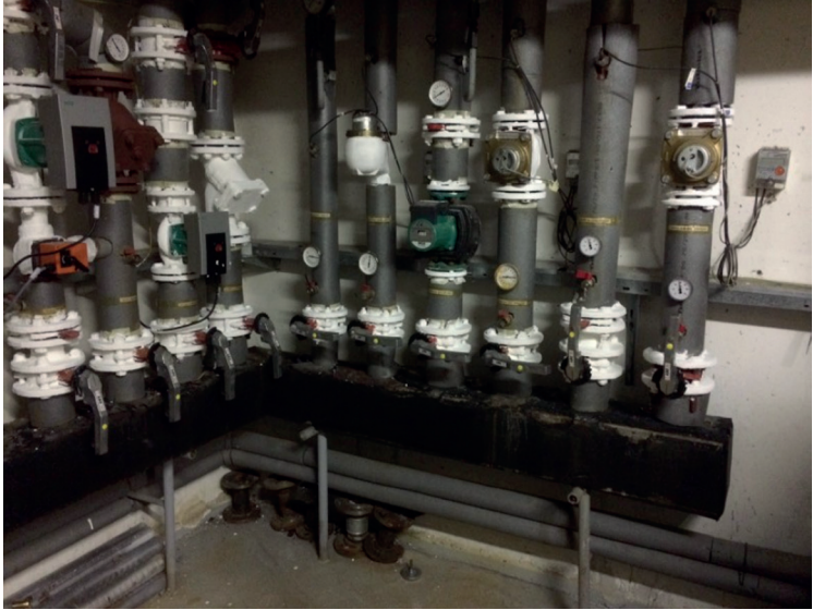
Fig. 4. Additional insulation of fittings